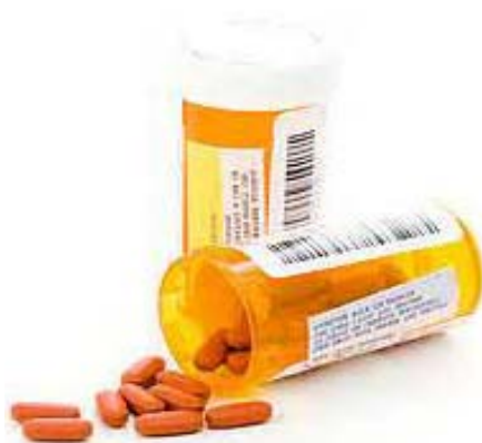
Pharmacy Technician Certification