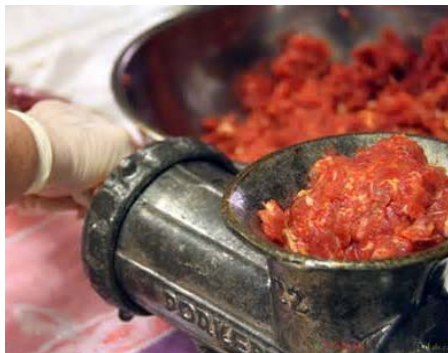
Discover Sausage Making

$55 SENIOR PRICE $50 121 TH 11/14 6:00-9:00 pm 621 TH 1/16 6:00-9:00 pm Instructor: Tritt